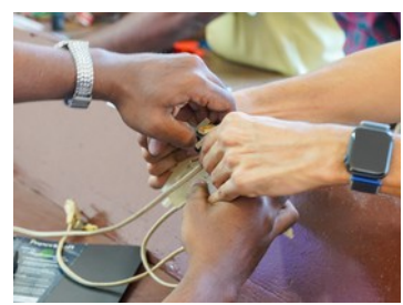
LEAP fosters team spirit

About LEAP: LEAP in the IIT-Madras Incubation Cell provides industry-oriented Project Based Learning to engineering colleges by focussed programs from 1 st to 4 th year of B Tech. LEAP is founded by IIT professors and industry veterans, with seed funding from the Maker Bhavan Foundation, USA.