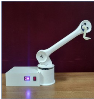
Robotic feeder, GEC Idukki